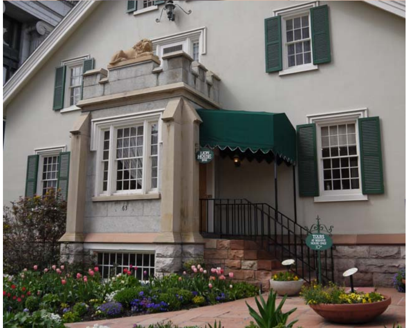
TOP: A decorated plaster buffalo on the lawn of the Council House, home of the Utah Office of Tourism. During the 2002 Winter Games, the life-size buffaloes, painted and decorated by local artists, were used to promote Davis County, home to a wild bison herd on Antelope Island. This buffalo sports the incorrect version of the state flag's design, being created nine years before the legislature's acted to correct it in 2011. BOTTOM: The Lion House, home of Brigham Young, and site of Saturday's Whitney Smith Dinner. The carved stone lion sports an impressive mane, as did Young!