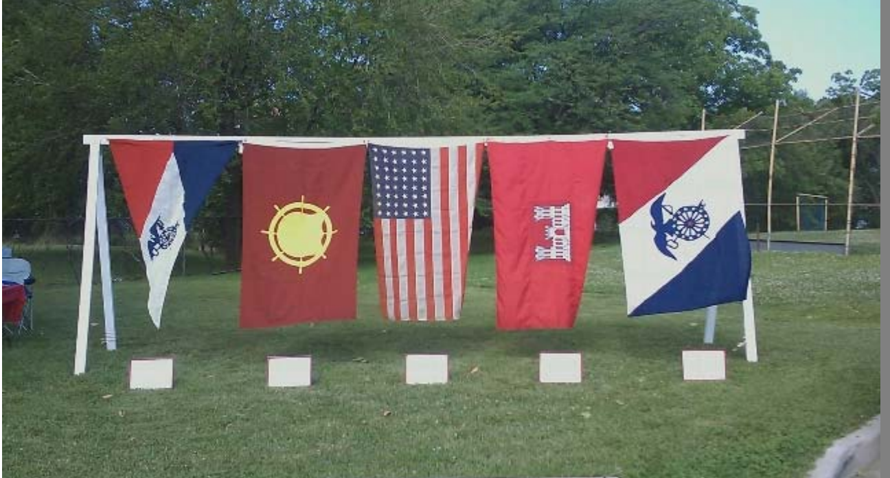
FIG. 1: Display of Army-related World War II flags, Fort Howard Veterans Park, Edgemere, MD.