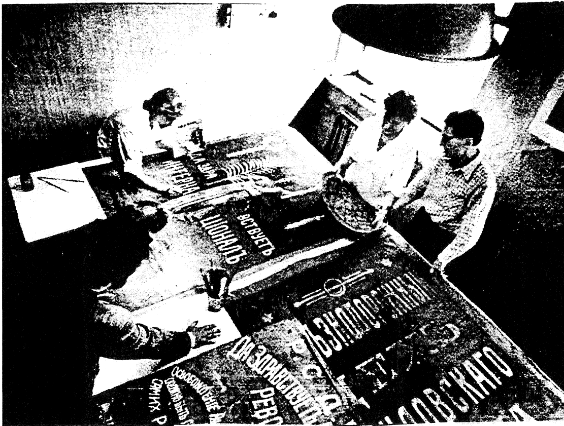
from: The Soviet Weekly London, England - 7 December 1974